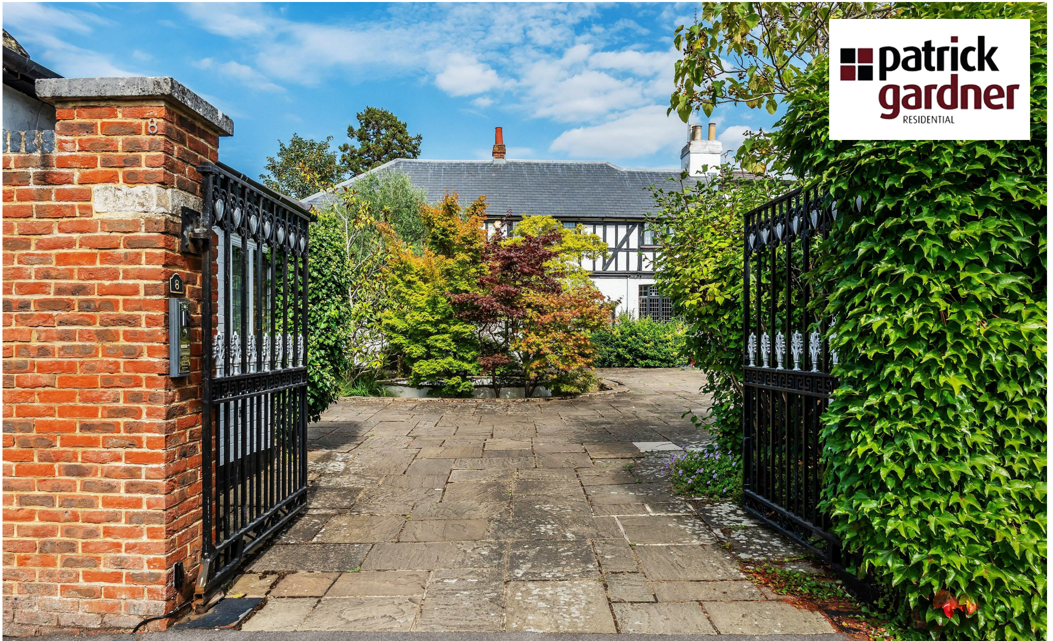
Old Court, 8 The Old Street, Fetcham, Surrey, KT22 9QJ